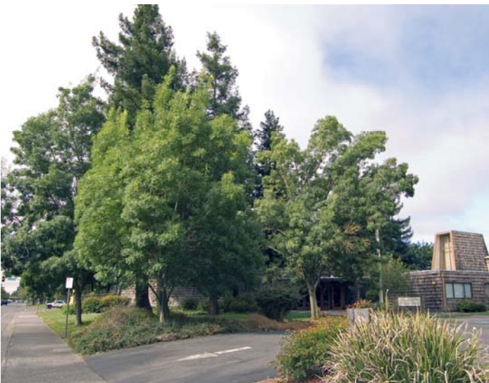
...and the trees.....