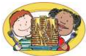
Breakfast for Lunch